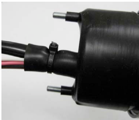
Figure 3. Installed Zip Tie