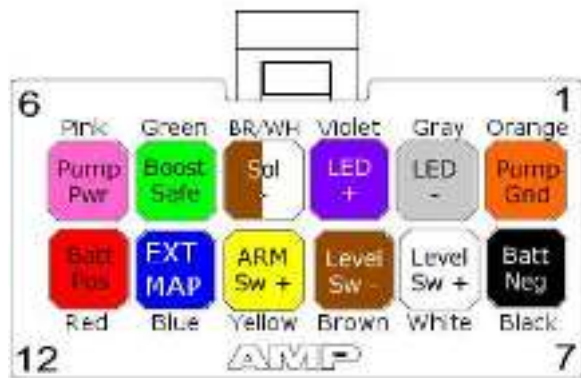
*Viewed from Wire Side of Connector

NOTE: THIS KIT INCLUDES NEW STYLE INJECTOR NOZZLES THAT HAVE INTERNAL CHECK VALVES. AN EXTERNAL CHECK IS NO LONGER NEEDED OR INCLUDED IN THIS KIT.